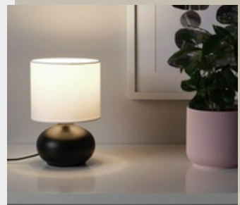
TABLE LAMP ■ ■ ■

Nightstand with a top shelf, a handy drawer, and an open storage compartment. White.