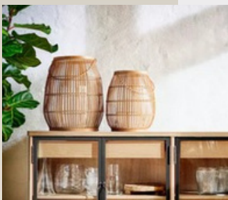
BAMBOO CANDLES ■

Hanging fabric parasol with UV protection, machine washable, and touch closure. White.