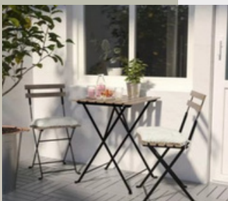
TERRACE GAME ■

Outdoor wooden table and two chairs set. Folding chairs. Black color stained light brown.