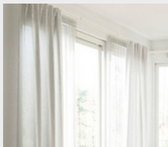
CURTAINS ■ ■ ■

Mirror with a delicate, refined and elegant design with rounded corners and a black frame.