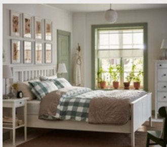
CAMA KING ■ ■ ■

King bed with solid pine frame. Tall headboard and adjustable sides. White. Hybrid king mattress, medium firm. Low king pillow, firm but also plush with a soft spot. 2-pack.