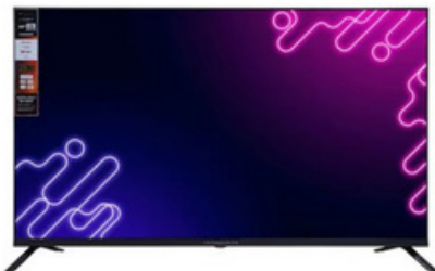
TV TECNOMASTER 43"

Sofa cushion made of soft cotton velvet fabric, adding volume and a pleasant feel. Black/white