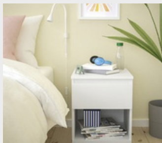
NIGHTSTAND ■ ■ ■

King bed with solid pine frame. Tall headboard and adjustable sides. White. Hybrid king mattress, medium firm. Low king pillow, firm but also plush with a soft spot. 2-pack.