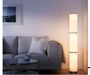
FLOOR LAMP ■

Pendant lamp with a velvet shade, soft to the touch and enhancing the color. The cable can be adjusted to achieve the desired height. Color: black/dark red velvet