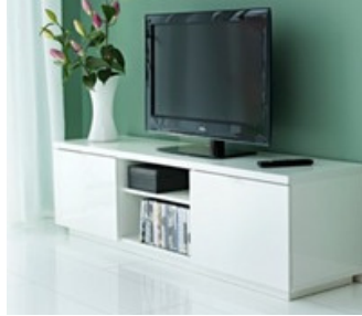
TV STAND ■

2-seater sofa with a deep, cozy seat made of wrapped springs, memory foam, and polyester fibers. The back cushions are reversible. Light beige.