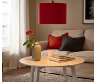
CEILING LAMP ■

TV bench with 3 compartments. 1 open compartment with an adjustable shelf. 2 compartments with doors and an adjustable shelf inside. High-gloss white.