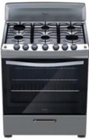
STOVE WITH OVEN

Poster frame, set of 8, Little Things. You can customize it to your liking by playing with the frame dimensions and the space in your home.