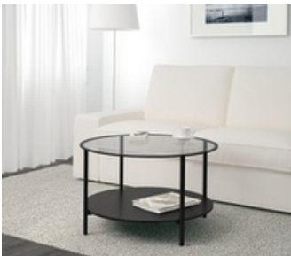
COFFEE TABLE ■

Floor lamp with a textile shade. Provides a diffused, decorative light. Color: white