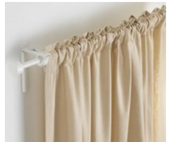
CURTAIN ROD ■

Short-pile, durable, and stain-resistant living room rug. Made of synthetic fibers. Color: beige/white polka dot.